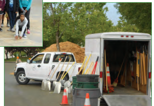
Parks Make Life Better – Coyote Crossing Event – April 25, 2015