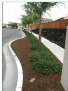
Water Smart Landscaping

San Ramon's water providers, East Bay Municipal Utility District and Dublin San Ramon Services District, are in full compliance with the new state mandates. The objective is to reduce potable water (suitable for drinking) by 20 percent to avoid critical shortages. For residents, the most significant change is a complete ban on outdoor irrigation between the hours of 9:00 am and 6:00 pm and