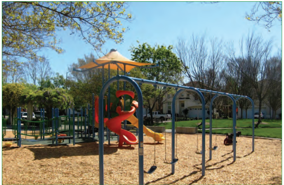
Richard Fahey Village Green Playground

In preparation for summer park use, the playgrounds at Old Ranch Park and Richard Fahey Village Green were recently upgraded. Staff conducted neighborhood meetings in September of 2014 to collect input on playground design features. Following approval by both the Parks and Community Services Commission and the City Council, staff worked with the playground installer to finalize the playground designs. Renovations began in March of 2015 and both playgrounds were completed and re-opened to the public in April of 2015.