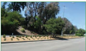
Water Smart Landscaping

no irrigation at all within 48 hours of measurable rainfall. You will also need to comply with the 2 non-consecutive days a week maximum watering rule.